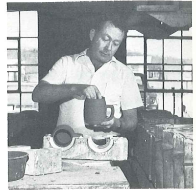
(2) Removing piece from mold.