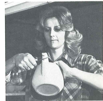
(4) Trimming with knife.