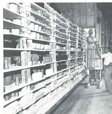
(7) Stacking kiln for firing.