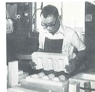
(8) Making a Mold