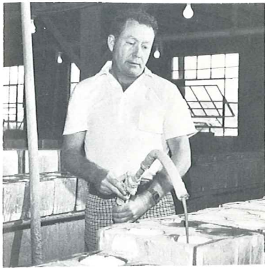
(1) Slip Casting